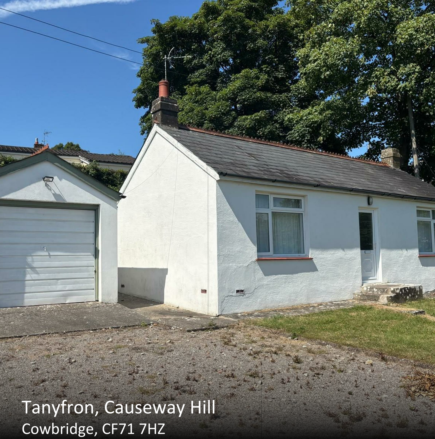
Tanyfron, Causeway Hill Cowbridge, CF71 7HZ